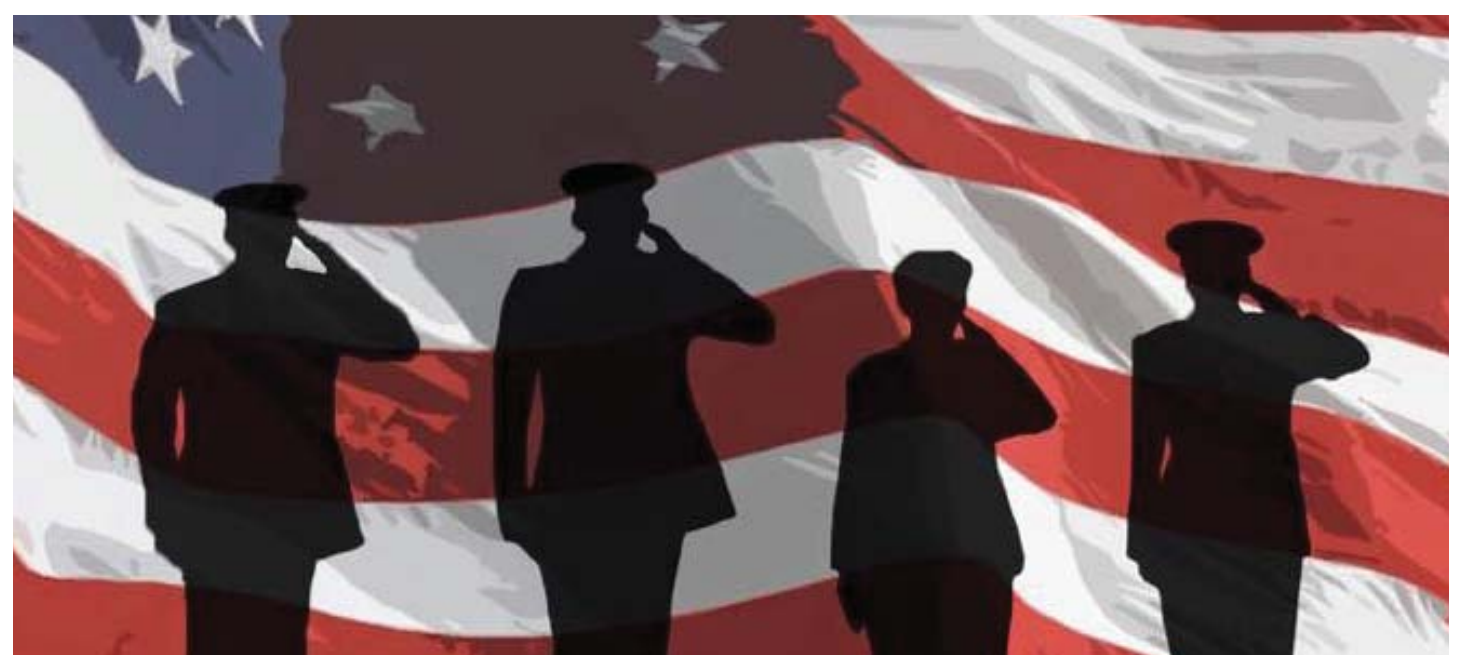
VETERANS DAY: NOV 11, 2020